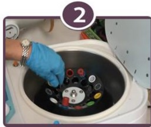
Put in the centrifuge