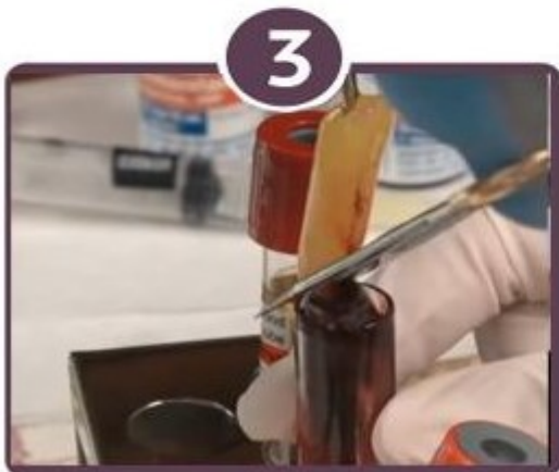
Separate the PRF